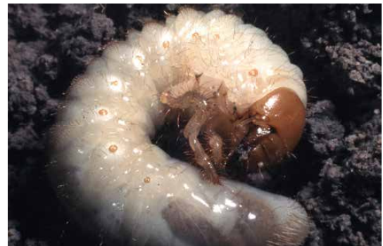
White Grub Complex