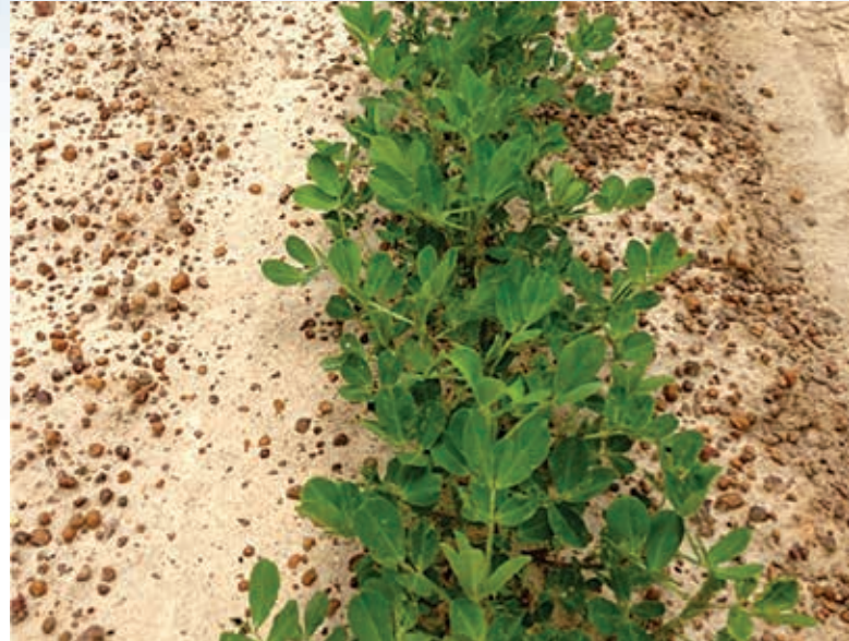
On the left are CruiserMaxx® treated peanuts and on the right are peanuts treated with THIMET®. Both plots featuring the Bailey variety were planted on May 10, 2013 and photos were taken at a University of Georgia plot at Lang Farms on June 11, 2013.