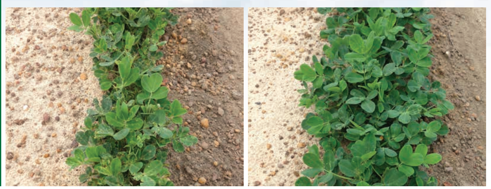
On the left are CruiserMaxx<sup>®</sup> treated peanuts and on the right are peanuts treated with THIMET<sup>®</sup>. Both plots feature the 06G cultivar and were planted on May 1, 2013. Photo was taken at a University of Georgia plot on June 11, 2013 at the Gibbs Farm, Tifton, GA.