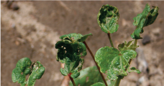
Typical crinkling and cupping of leaves caused by thrips damage.