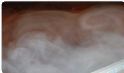
SmartBlock vapor coming through potato pile

SmartBlock ® is the breakthrough, post-harvest sprout inhibitor that gives you the versatility to effectively manage and achieve sprout control in stored potatoes. It can be used as a stand-alone treatment or in combination with other sprout inhibitors. SmartBlock acts only on the exposed and rapidly growing sprout tissue, and is safe for use on all potatoes, except seed potatoes.