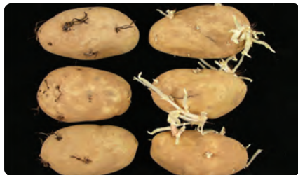
SmartBlock — treated vs untreated potatoes