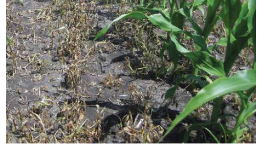
Impact on glyphosate-resistant waterhemp

Impact controls glyphosate-resistant weeds including Palmer amaranth and waterhemp.