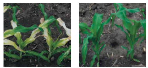
Sweet corn, mesotrione – 3 fl oz + COC Sweet corn, Impact – 0.75 fl oz + COC + UAN