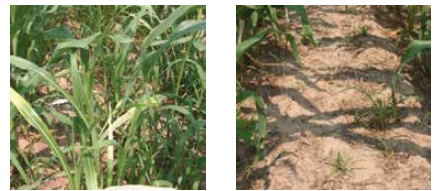
HPPD Competitor B 3 fl oz + COC + UAN Impact 0.75 fl oz + MSO + UAN