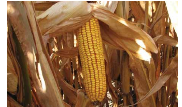
Yield: 236 bu/A – normal ear development

*Maximum label use rate of Impact is 1 fl oz/A