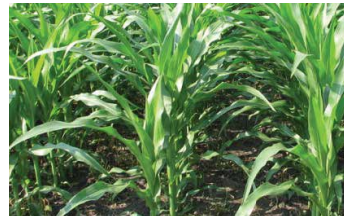
Impact 8x rate/A plus MSO and AMS