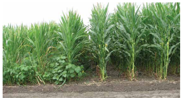
Untreated check vs. ImpactZ at 8.0 fl oz/A POST

See our entire line of products at AMVAC.com