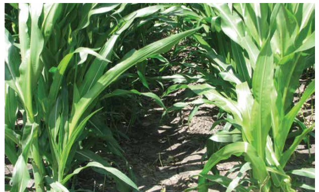
ImpactZ at 8.0 fl oz/A POST

Choose the hybrids you want to plant – from herbicide-tolerant traits to conventional corn. Then, apply ImpactZ in the program best for your field conditions – from weed emergence until corn reaches 12 inches in height.