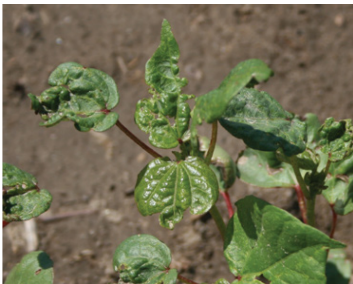
Typical crinkling and cupping of leaves caused by thrips damage.