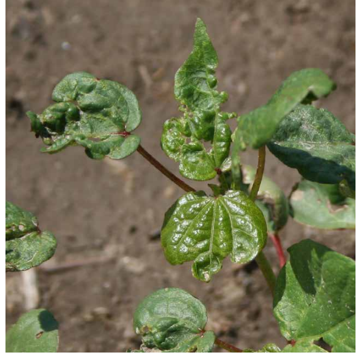
Typical crinkling and cupping of leaves caused by thrips damage.

Compared with other commercial combinations, Bidrin® provides better control of thrips, stink bugs, and tarnished plant bugs and equivalent control of fleahoppers giving growers the advantage of reducing damage and yield loss. Results from over 200 commercial field trials conducted from 2014-2017 demonstrate that Bidrin is a useful and effective tool for managing infestations in U.S. cotton. Choose Bidrin to deliver the critical control you need for strong stands and top yield potential.