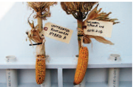
Untreated vs. AZTEC