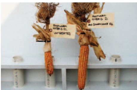
Untreated vs. SmartChoice

From the superior rootworm control of AZTEC, to the unique nematode control of COUNTER, to the flexibility of SmartChoice — make the most out of your RIB planted fields with the Granular Advantage from AMVAC. For more information, go to: amvacsmartbox.com