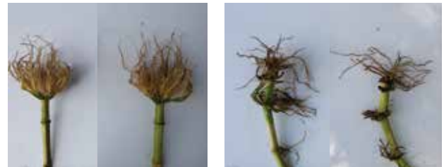
AZTEC HC applied in-furrow (left) vs. untreated check on non-rootworm trait hybrid (right). 2019 SD trial.

*Percent consistency of rootworm control equals percent of roots sustaining ≤ 0.25 node-injury (NI) on 0-3 NI scale. Hybrids evaluated across trials include Refuge (no rootworm trait), SmartStax® RIB Complete®, Optimum® AcreMax® Xtreme and Agrisure Duracade® E-Z Refuge.