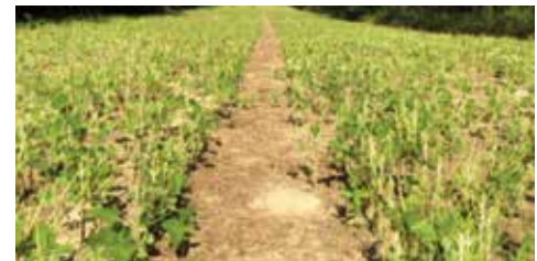
Damage on soybeans not treated with Hinder.

For best results, apply Hinder before the animals start feeding on the plants to be protected. Under conditions of severe hunger, treated plants may be damaged substantially.