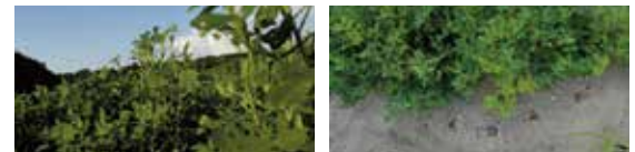
Damage on peanuts not treated with Hinder.

Soybeans and Peanuts: Mix 1 to 2 quarts of Hinder per 10 gallons of water. Apply by ground or aerial equipment at rates of 10 - 20 gallons of spray solution per acre.