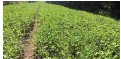
Soybeans treated with Hinder.

See our entire line of products at AMVAC.com