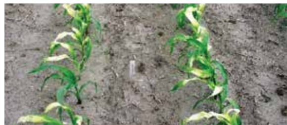
Mesotrione 4SC at 6 fl oz/A postemergence to corn treated with Counter 20G in-furrow at planting.

See our entire line of products at AMVAC.com