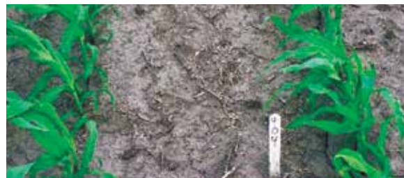
Impact at 2 fl oz/A postemergence to corn treated with Counter 20G in-furrow at planting.

Use these outstanding products to deliver premium insect and weed control without interaction to maximize yield potential. Select herbicides, such as mesotrione and ALS inhibitors, are known to interact with Counter 20G.