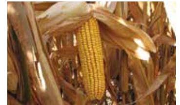
Yield: 236 bu/A – normal ear development

*Maximum label use rate of Impact is 2 fl oz/A