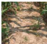
Impact 0.75 fl oz + MSO + UAN