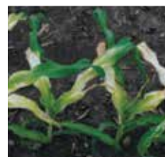
Sweet corn, mesotrione – 3 fl oz + COC