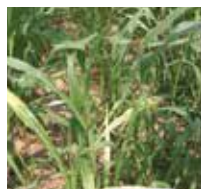
HPPD Competitor B 3 fl oz + COC + UAN