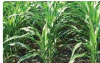
Impact 4x rate/A plus MSO and AMS