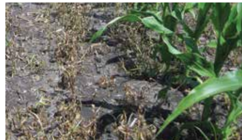
Impact on glyphosate-resistant waterhemp

Impact controls glyphosate-resistant weeds including Palmer amaranth and waterhemp.