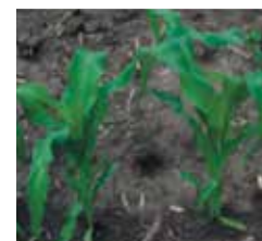
Sweet corn, Impact – 0.75 fl oz + COC + UAN