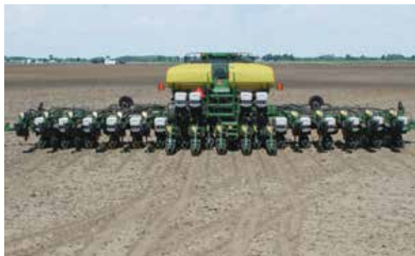
Red, white, blue, green and all colors in between: A SmartBox+ System fits your planter

Force 10G HL SmartBox Insecticide in SmartBox product transfer containers is recommended for application ONLY while using SmartBox+ or Precision Planting® vDrive® equipment.