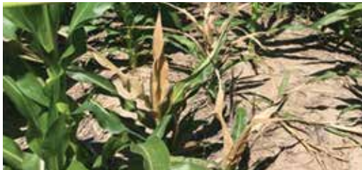
Grass weeds above shown 14 days following Assure II application in Enlist corn. Upper plant portion always exhibit herbicide symptoms before the lower portion.