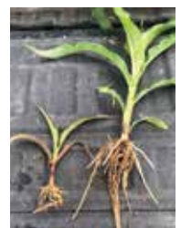
Nematode stunting damage to untreated corn, middle 12 rows, versus Counter 20G treated corn on the left and right in a Tuckerman, AR field. Right photo, untreated (L) vs. Counter 20G treated (R) plants.