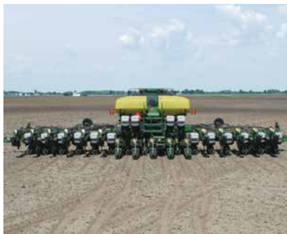
Red, white, blue, green and all colors in between: A SmartBox+ System fits your planter

Force 10G HL SmartBox Insecticide in SmartBox product transfer containers is recommended for application ONLY while using SmartBox+ or Precision Planting® vDrive® equipment.