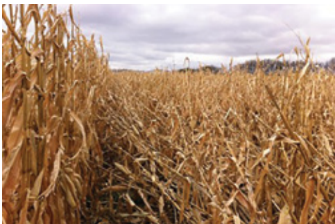
Standing corn with AZTEC 4.67G in-furrow (L) vs. lodged, untreated corn at harvest.

Crops: Field corn, sweet corn, popcorn, corn grown for seed or silage