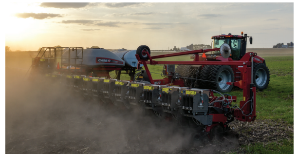
SIMPAS ® and SmartCartridge containers apply insecticides, fungicides, nematicides and micronutrients in one simple pass.

From Case IH ® to John Deere ® to Great Plains ® to Kinze ® to White ™ , SIMPAS application system equipment is designed to fit a wide variety of planter makes and models with easy-to-install planter-specific brackets. Accuracy, safety and versatility – make the smart move to the SIMPAS closed handling and application system.