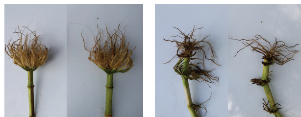
AZTEC HC applied in-furrow (left) vs. untreated check on non-rootworm trait hybrid (right). 2019 SD trial.

*Percent consistency of rootworm control equals percent of roots sustaining ≤ 0.25 node-injury (NI) on 0-3 NI scale. Hybrids evaluated across trials include Refuge (no rootworm trait), SmartStax® RIB Complete®, Optimum® AcreMax® Xtreme and Agrisure Duracade® E-Z Refuge.